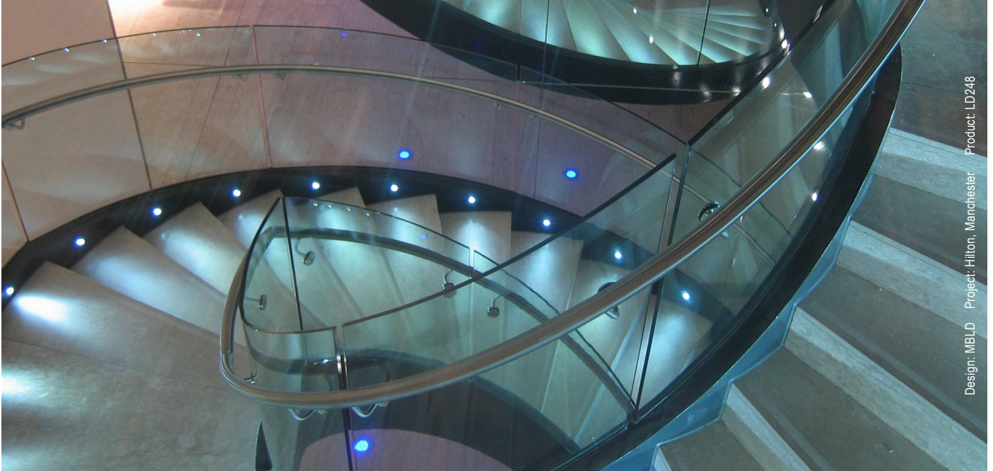
Design: MBLD Project: Hilton, Manchester Product: LD248

Available in round or square, the LD45/46 will fit into most architectural styles. Manufactured with a machined stainless steel 316 bezel and black anodised body these can be used for indoor and outdoor use. The compact design with the optic set back makes them ideal for steplighting. A 12° lens will kiss light across the step or 31° lenses to wash light more directly to the edges. Available with a choice of lens angles and LED colours.